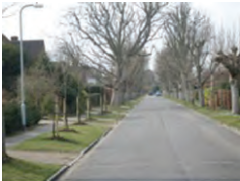
Newly planted trees in Beechwood Avenue