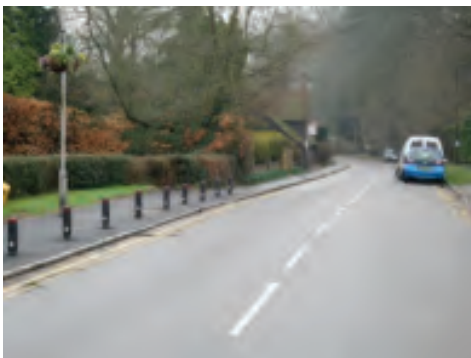
Pictured left: Burtions Lane bollards