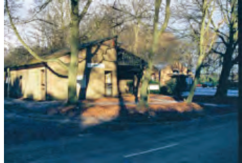
Little Chalfont Community Library