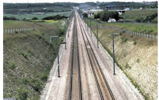
HS2 - Straight through the Chilterns Area of Outstanding Natural Beauty?