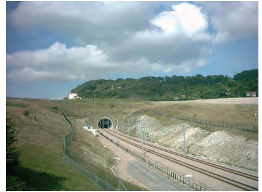
What the tunnel would look like as it enters Old Amersham